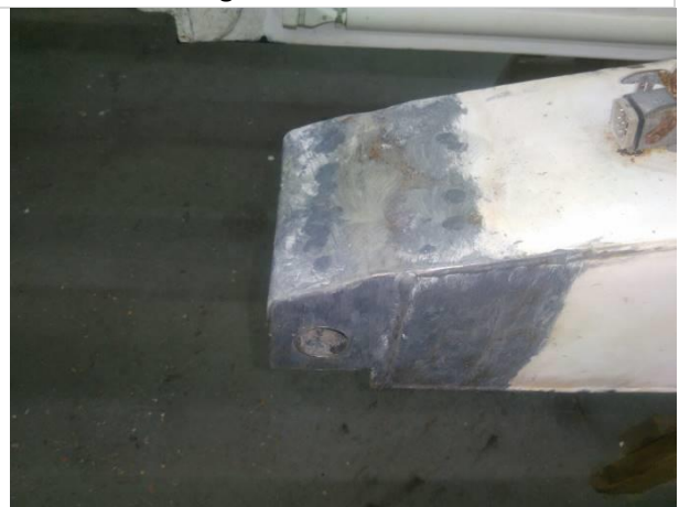
Figure 4 Area of paint removal