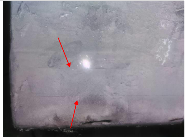
Figure 2 Areas of cracking