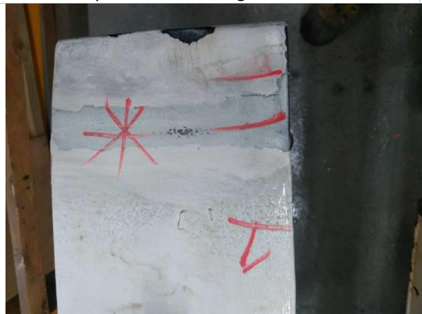
Figure 9 Additional picture of cracking