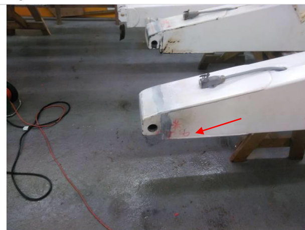
Figure 5 Location