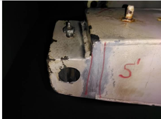
Figure 7 Additional picture of cracking