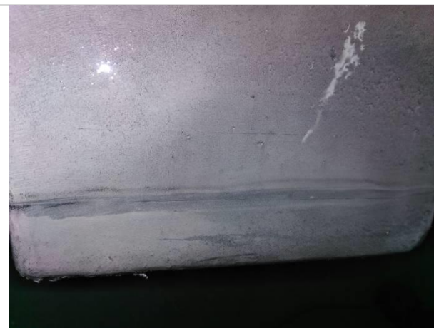
Figure 3 Cracking still present after grinding to a depth of 1.5mm