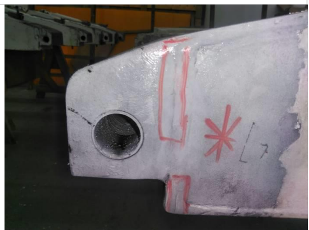
Figure 6 Areas of cracking