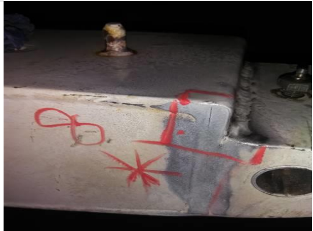
Figure 8 Additional picture of cracking