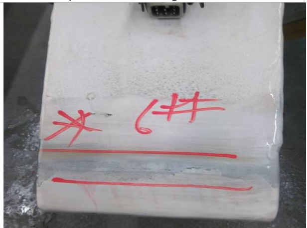
Figure 10 Additional picture of cracking